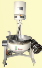
Cooking Machine Capacity 50, 100, 200, 500 Liter