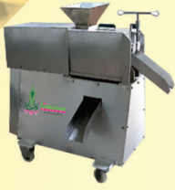
Amla Juicer Machine Capacity 50, 100, 200, 300kg / hour