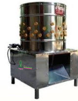
Chicken Feather Clean Machine