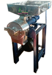
Pulverizer Machine Capacity 25 to 80 kg / Hr