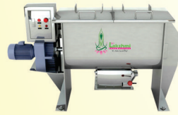
Blender Machine Capacity 50, 150, 250, 500 kg