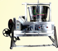
Hallwa Kova, Mysoorpa Making Machine Capacity 20, 40, 120 kg