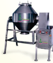
Cone Blender Machine Capacity 50, 150, 250, 500 kg